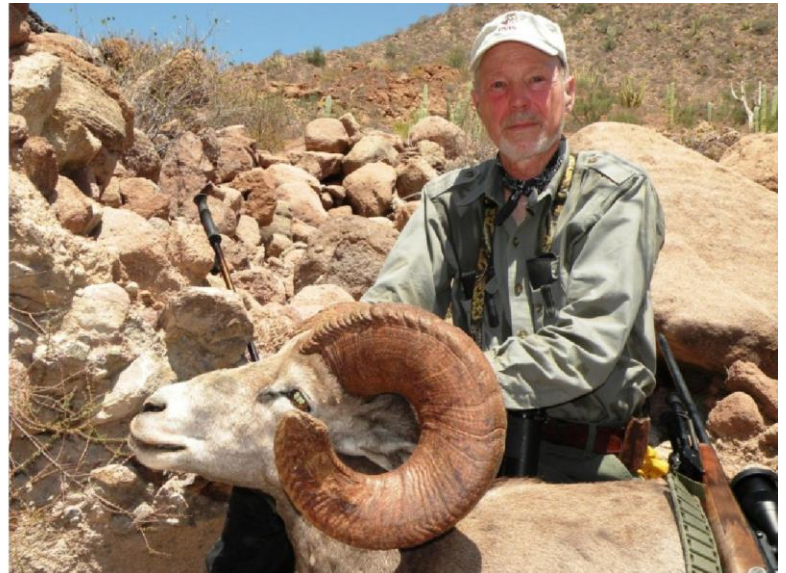
Green Score 167 B&C Points

We recommend RIPCORN for your Rescue Travel Insurance. They provide a one-stop integrated travel protection program for adventurers and 24/7 contact with medical and security professionals. They are a medical and travel security risk company that provides worldwide evacuation and rescue services from your point of emergency all the way home. www.ripcordrescuetravelinsurance.com/portal/highmtnhunts