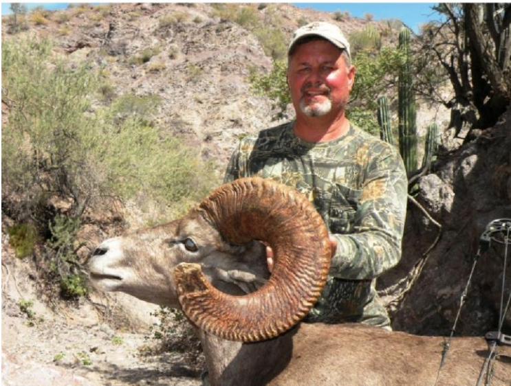
Green Score 171.25 B&C Points