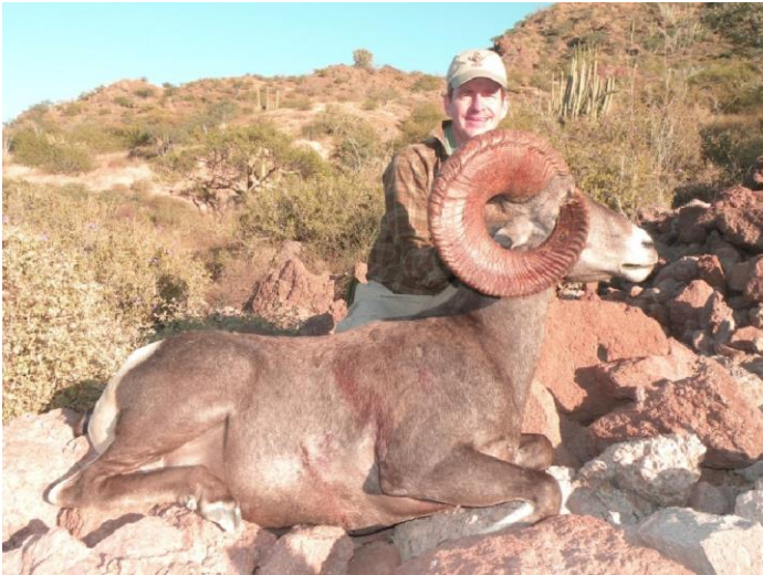
Trophy Class Ram-Green Score 180 B&C Points