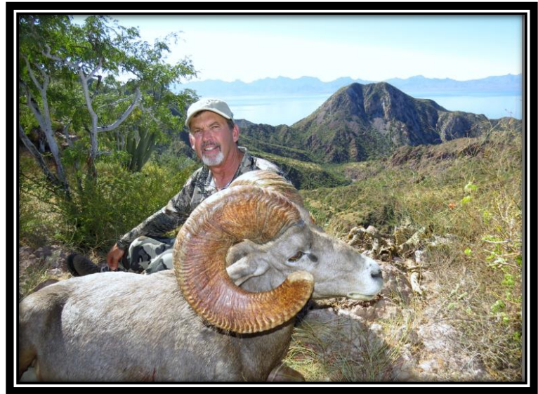
El Carmen Island Taken 2015

lodging and meals in case you overnight in town, special food, cost of medications, immunizations, hospitalizations and services of doctors, charges for evacuation or rescue by ambulance, helicopter or airplane, and any other service or product that is not agreed or mentioned in this document.