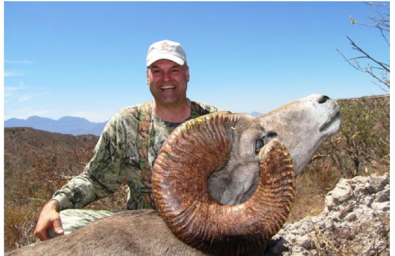
Green Score 162.125 B&C Points